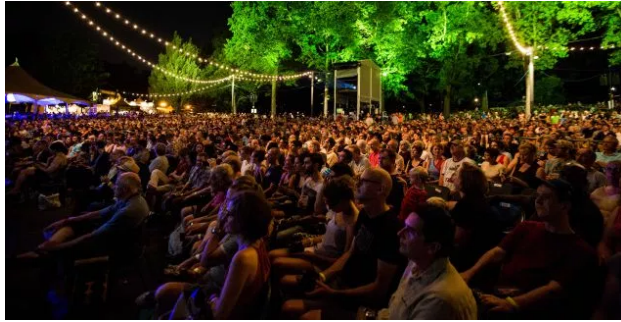
The Hubble Cantata premiered in Brooklyn on August 6, 2016.

Many families brought young kids to the performance, which was both free and outside, and for its entire spectacle, a more enticing young person's gateway into the world of classical music does not exist.