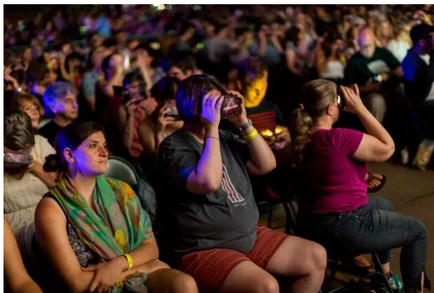
Patrons use their VR headsets on a journey to The Orion Nebula in “The Hubble Cantata”, which premiered in Brooklyn on August 6, 2016.

After four years in the making, the success of this multi-disciplinary performance lies in its ability to exist as both high art and popular entertainment. And so The Hubble Cantata is a work that knows no parallel, pushing boundaries of technology and presentation that push our city's relationship with multi-disciplinary performance further into uncharted territory.