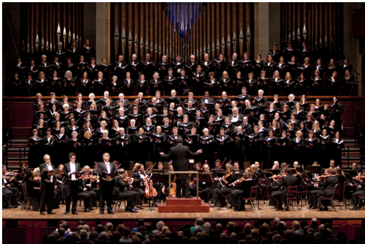
The Washington Chorus.

On Sunday, November 13, 2016, the pulsating, transcendent and visionary music of the modern musical giant of minimalist music, Philip Glass —came to vivid life in a unique and powerful concert event. The Washington Chorus presented a stirring interpretation of Mr. Glass' Symphony No. 5 .