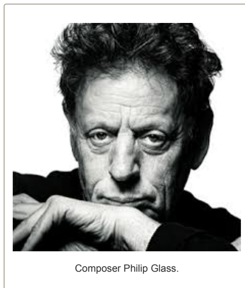
Composer Philip Glass.

Yet—if I was forced to single out any of the musical accompaniment to this metaphysical Symphony, I might have to look toward the stunning interpretive vocal prowess of the five lead soloists.